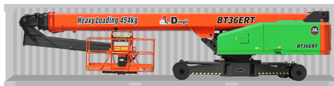
Standard Container Transport